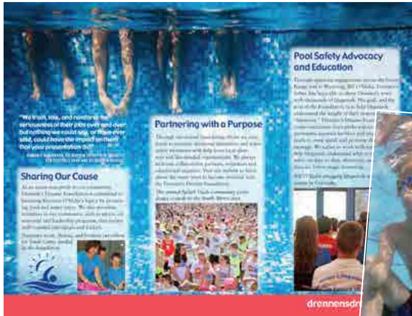
COMMUNITY EDUCATION BROCHURE DRENNEN'S DREAMS