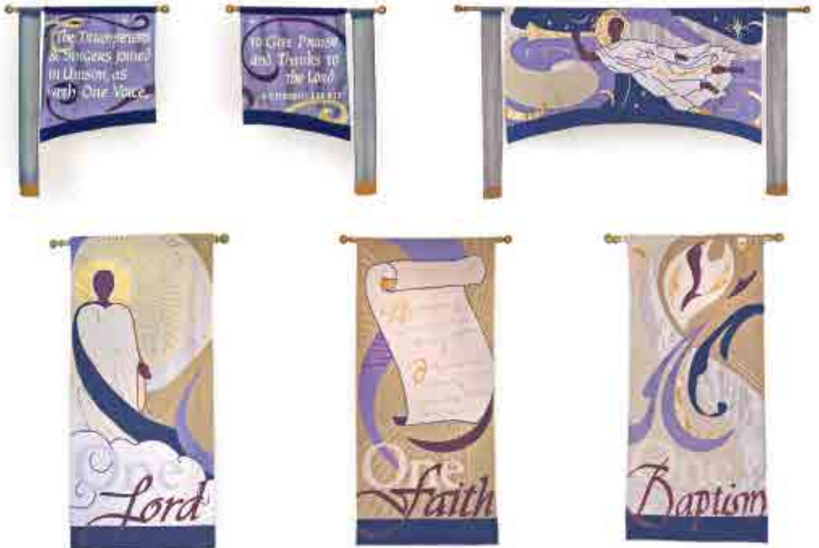
INTERIOR LITURGICAL BANNER DESIGNS (ROUGH SCALE MAX HT APPROX 7')

carla@cjmaxart.com • 303.437.0373 • studio base-camp: mile-hi denver metro area, colorado, usa