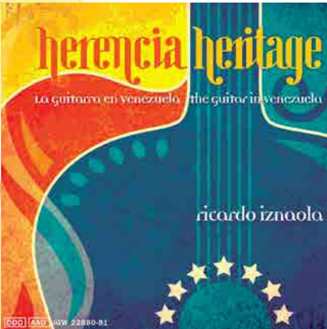
BRANDYS ARTIST MANAGEMENT, DENVER, CO

(adapting MLB event identity to invitations)