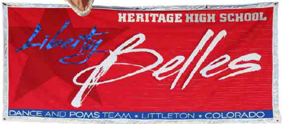
INTERIOR SPACES & CUSTOM DISPLAY BANNERS