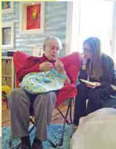
DESIGN MEMORIAL YOUTH ROOM ST TIMOTHY'S CHURCH, CENTENNIAL CO Including remodel, planning, mural, furnishing