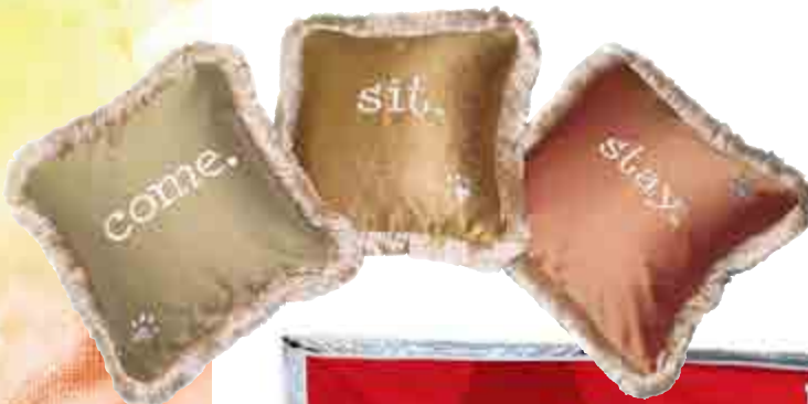
DESIGN CUSTOM DECOR & BANNERS