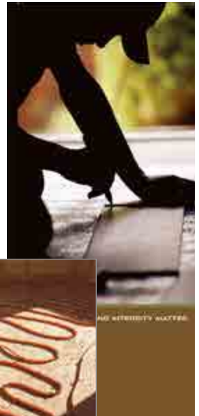
PROMOTIONAL BROCHURE OMAC CONSTRUCTION