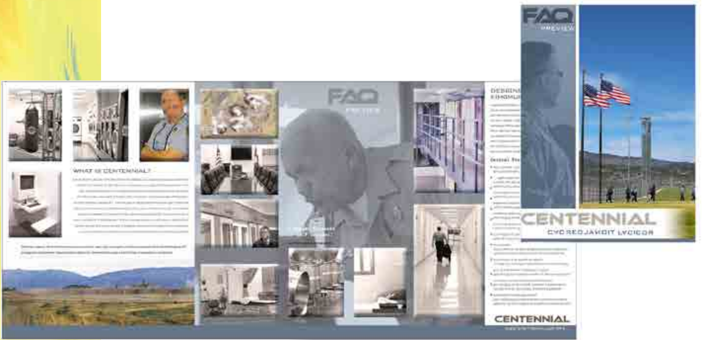
DESIGN & PHOTOGRAPHY OF INTERNAL COMMUNICATIONS, GOVERNMENT AGENCY (CONTENT REDACTED OR DISTORTED FOR CONFIDENTIALITY)